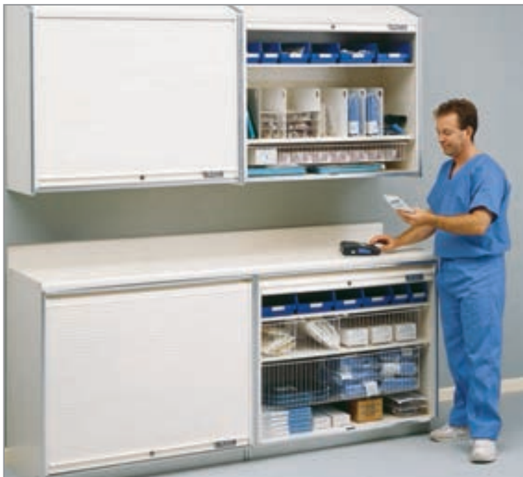
(Pictured—Two each of M1601 and M2201 with 82" continuous counter top)

M1601 Upper Wall Cabinets 16"D x 41"W x 37.08"H